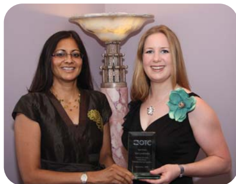
The candidate who scores the highest marks in the examination receives an award.

There are two papers in total: paper one is one hour and 40 minutes in duration and covers the compulsory modules and paper two is one hour and 20 minutes in duration and covers the elective modules. Examination questions are multiple choice.