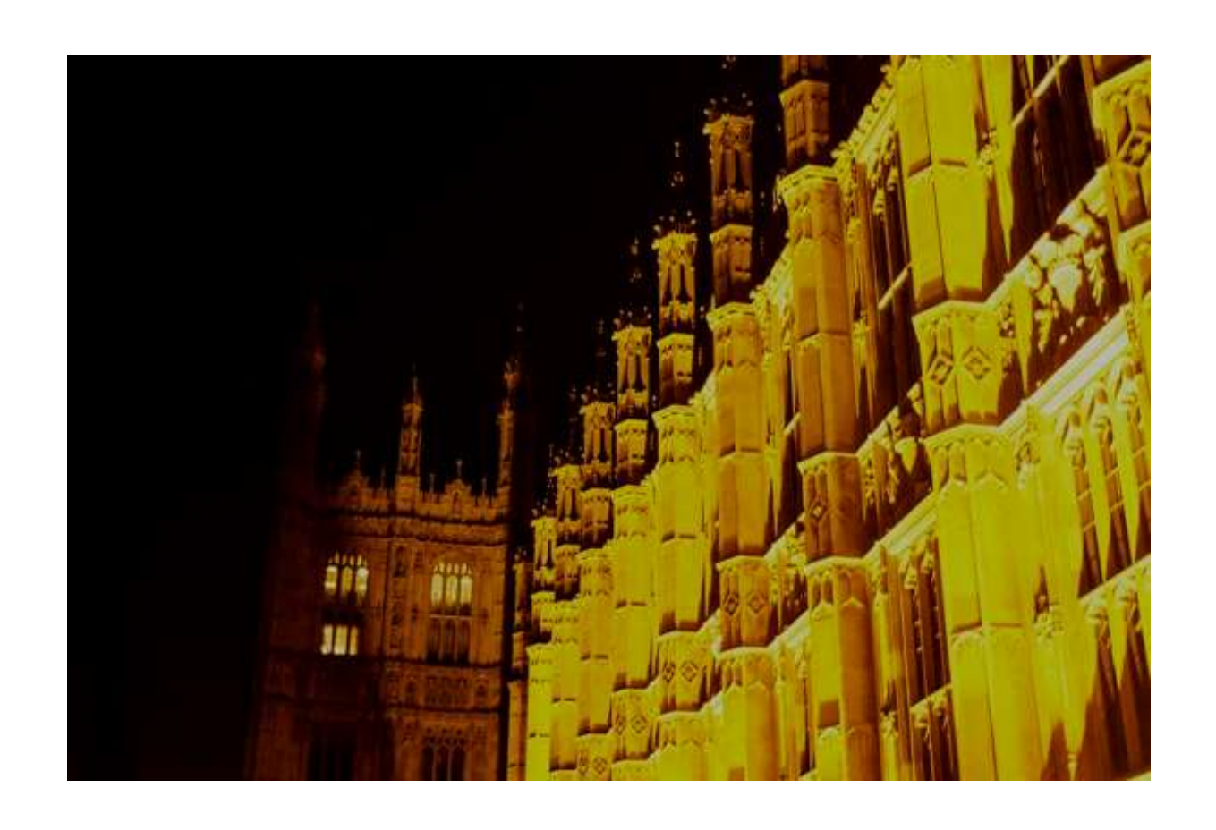
Inquiry Report into the Sustainability of the NHS "Is Bevan's NHS under Threat?"