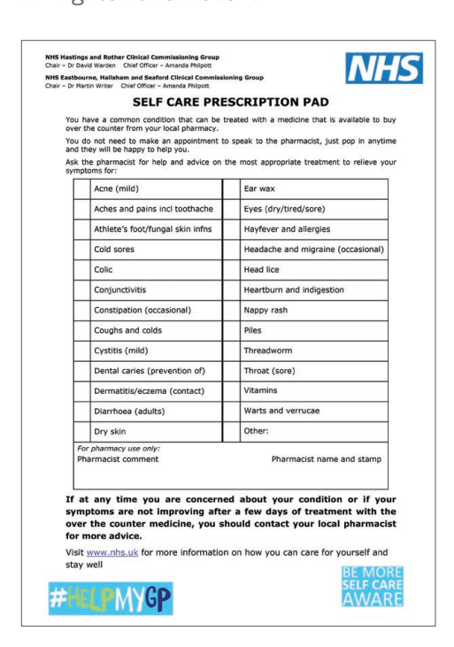
Figure 1: NHS Hastings and Rother Clinical Commissioning Group, NHS Eastbourne, Hailsham and Seaford Clinical Commissioning Group, Self care prescription pad

To further incentivise GPs, a domain for self care has been included in the 2019/20 Prescribing Quality Improvement Scheme<sup>23</sup>. The scheme is voluntary, rewarding high-quality and cost-effective prescribing in Brighton and Hove<sup>24</sup>.